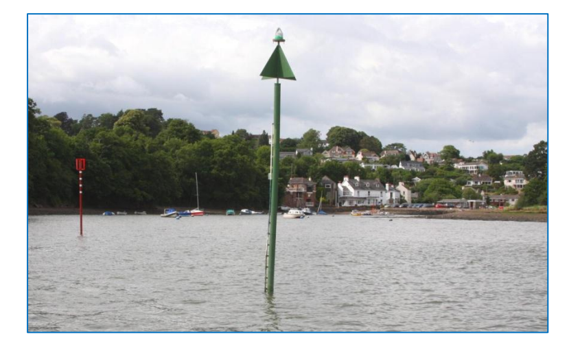
Entrance to Stoke Gabriel Creek (Chart point 8)

Stoke Gabriel offers pubs, the quayside 'River Shack' cafe/bistro, ice cream and great crabbing. Outside the creek, there are a few visitors mooring buoys. Red and green posts indicate that the channel meanders to the port bank then over to starboard of the dinghy pontoon. The creek leads to a dam; on which it's possible to tie-up, but most people moor outside and dinghy in.