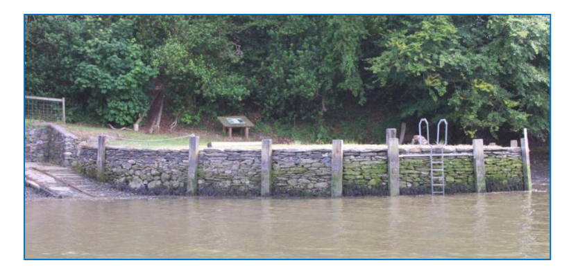
Sharpham landing stage (Chart point 12)

The vineyards run down towards the river bank around Sharpham Pt. and a landing stage in Fleet Mill Reach offers the chance of a visit.