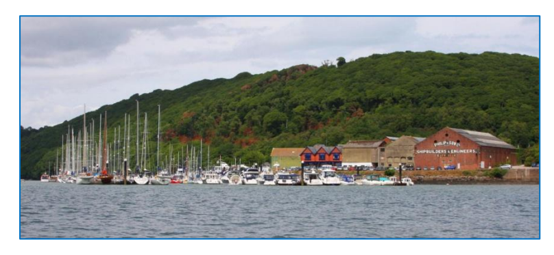
Noss Marina (Chart point 1)

Heading North past Noss Marina, then NW the river becomes tree lined with the deeper water favouring the starboard side of the channel.