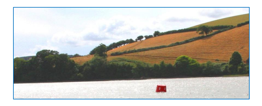
No.2 red can and entrance to Bow Creek (Chart point 9)

Carrying on up the Dart deep water shifts onto the West bank near White Rock. No.2 red can marks the turn North for Totnes or West into Bow Creek.