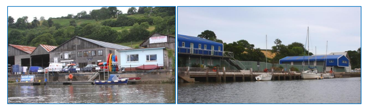
Baltic Wharf (Chart point 13)

Mooring is available at Baltic Wharf or opposite, alongside the wall at Steamer Quay.