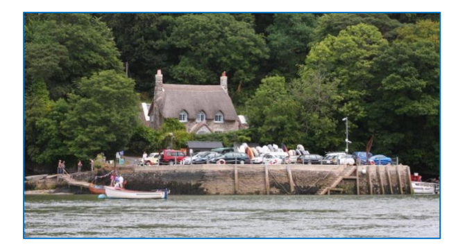
Greenway Quay and ferry cottage (Chart point 4)

A steep lane climbs from Greenway Quay past ferry cottage up to Greenway House, once the private holiday home of Dame Agatha Christie, now National Trust and open to visitors. A water taxi operates to Greenway Quay, Dittisham and offers boat transfers.