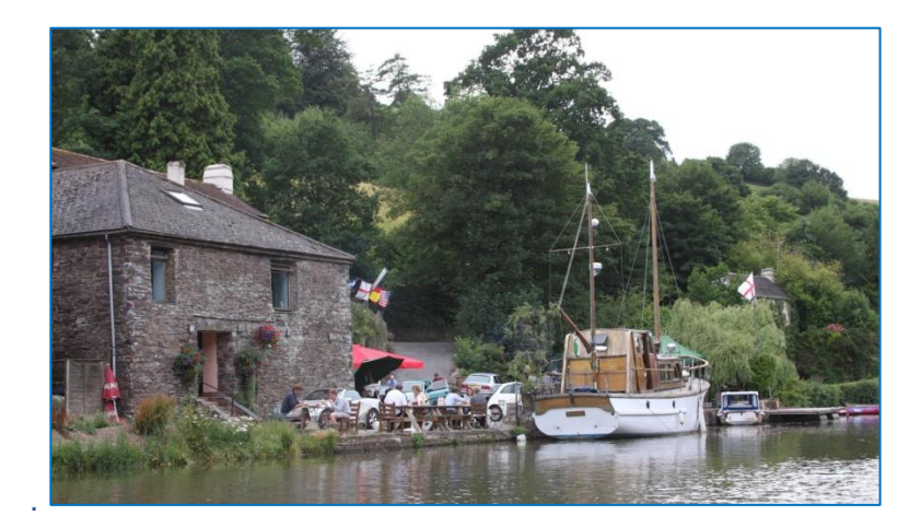
The Malsters Arms - Quay and pontoon (Chart point 10)

The top of Bow Creek offers the Malsters Arms at Tuckenhay. The Malsters, once owned by Keith Floyd, is included in The Times best 50 places to eat alfresco, (April 2010). Depending on draft, the pontoon and wall alongside the pub is accessible 2 hours either side of HW. Overnight mooring is allowed by booking in advance. The channel is marked by posts which wind in intricate S shapes for <sup>3</sup>/<sub>4</sub>m to the pub.