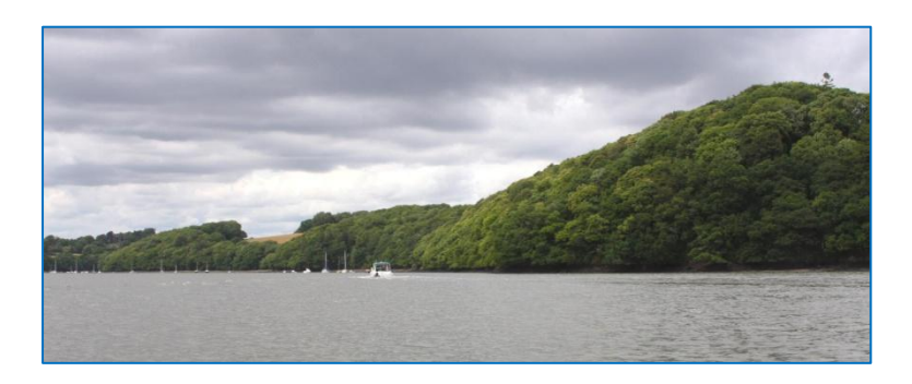
Pighole Pt (right) and the moorings leading to Stoke Gabriel (left) (Chart point 7)

Follow the mooring trots that lead around to Stoke Gabriel creek.