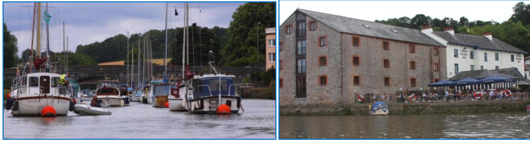
Totnes Bridge (Chart point 15)

Totnes is a bustling medieval market town with great shops, pubs, restaurants and even a castle. From here you can even follow the Dart North by catching a steam train from Totnes to Buckfastleigh.